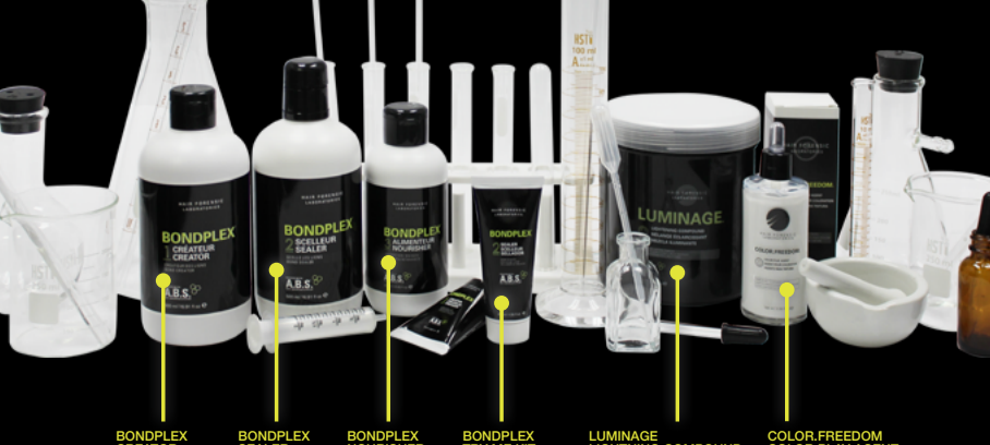
BONDPLEX CREATOR CREATEUR (1) HFBONDPLEX1